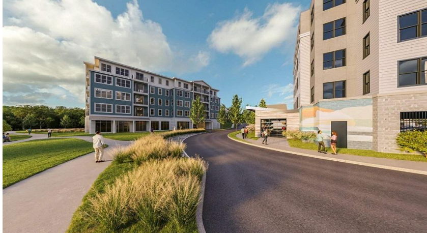
The Cochecho Waterfront Development Advisory Committee approved site plans and architectural renderings for the waterfront project planned on River Street.