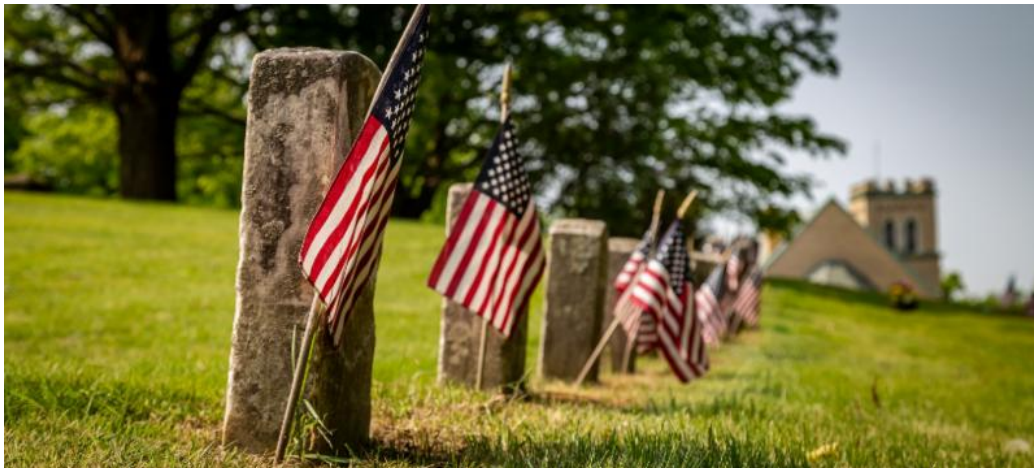
Placement of flowers and flags at Pine Hill Cemetery