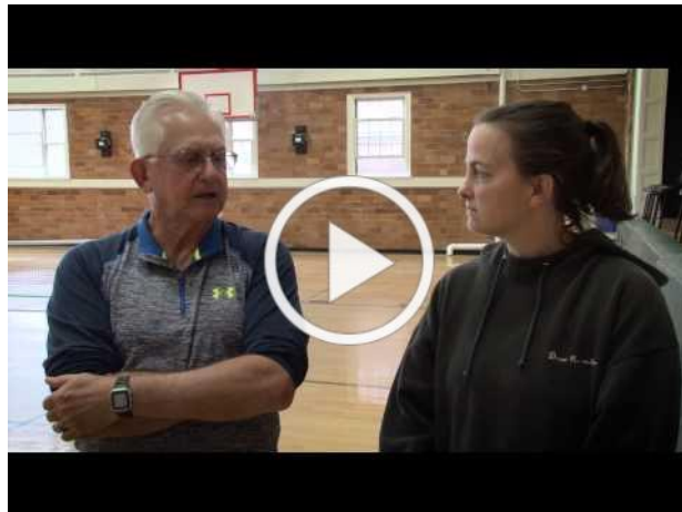
Pickleball at Dover Recreation

For more information, please call 516-6436 or visit the Pickleball page here .