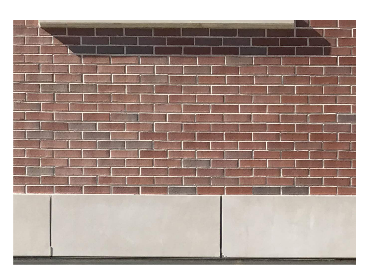
FULL WYTHE BRICK VENEER