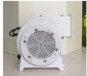
Blower*1 ( The blower is built into the product)