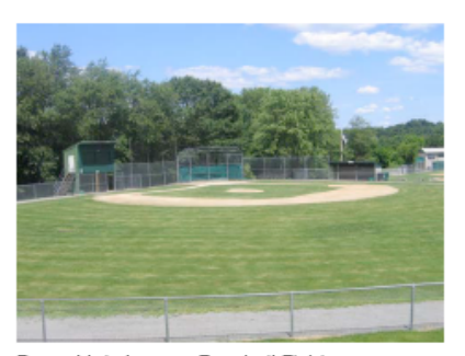
Dover Little League Baseball Fields