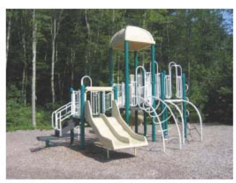
Alden Woods Playground