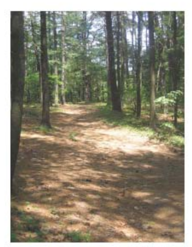
Willand Pond Hiking Trail