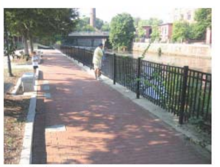
Cochecho River Walk