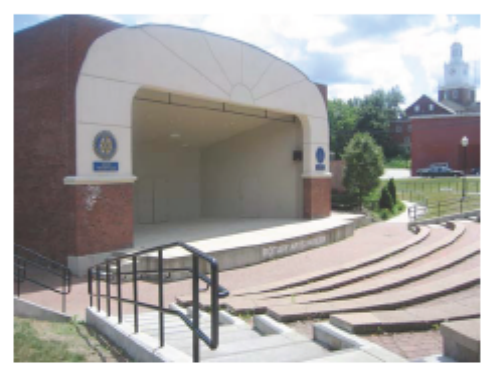
Rotary Arts Pavilion