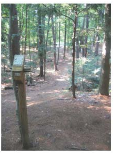
Bellamy Park Disc Golf Course