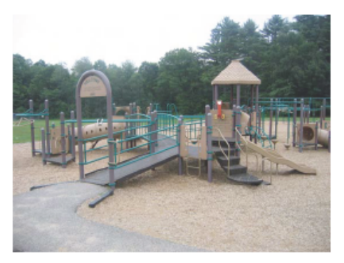
Garrison Elementary School Playground