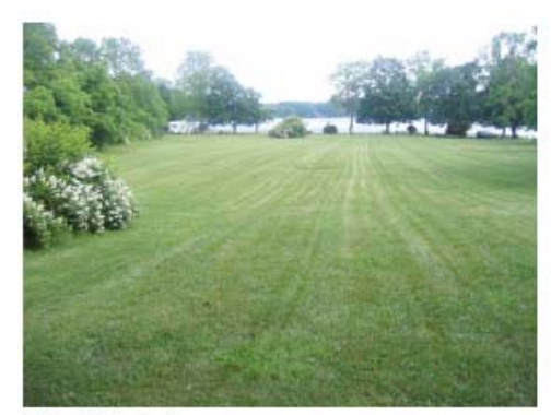
Hilton State Park