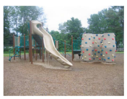
Horne Street School Playground