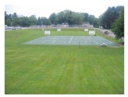
Woodman Park Basketball Courts