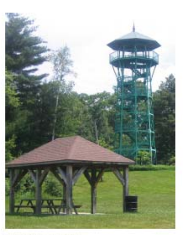
Garrison Hill Park