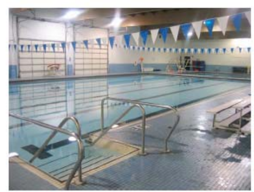
Dover Indoor Pool