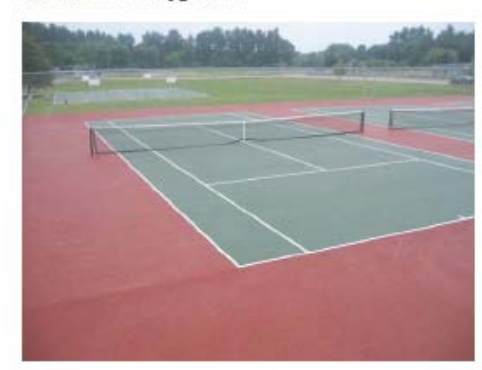
Woodman Park Tennis Courts