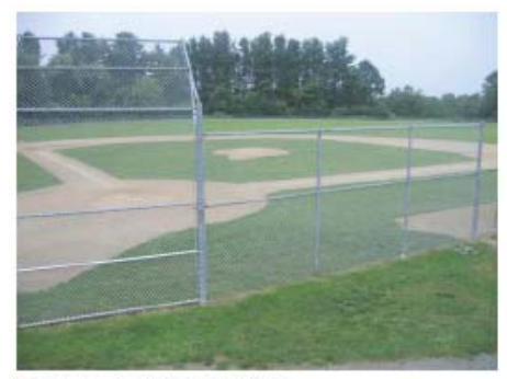
Woodman Park Baseball Field