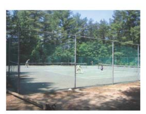
Long Hill Park Tennis Courts