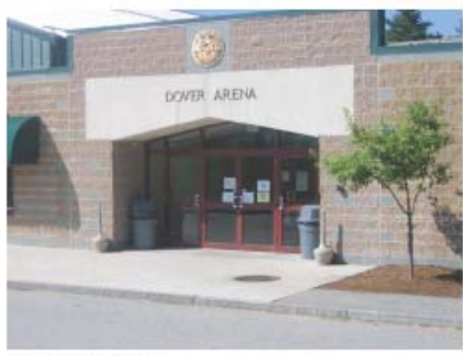
Dover Ice Arena