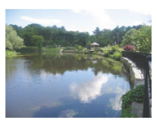
Henry Law Park and Cochecho River