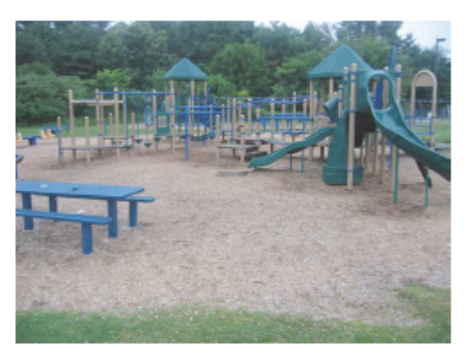
Woodman Park Playground