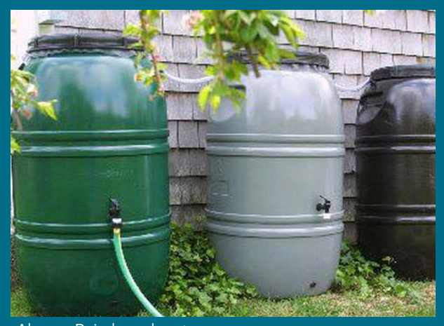
Above: Rain barrel system

Dover is participating in the Great Bay Rain Barrel Project program which invited 42 New Hampshire towns, and 10 in Maine along eight rivers that feed the Great Bay Estuary to be part of a rain barrel initiative. This program purchases a bulk supply of rain barrels and provides them to local groups to sell to property owners for a reduced cost. Rain barrels are a stormwater management mechanism, keeping stormwater from transporting excess nutrients into waterbodies.