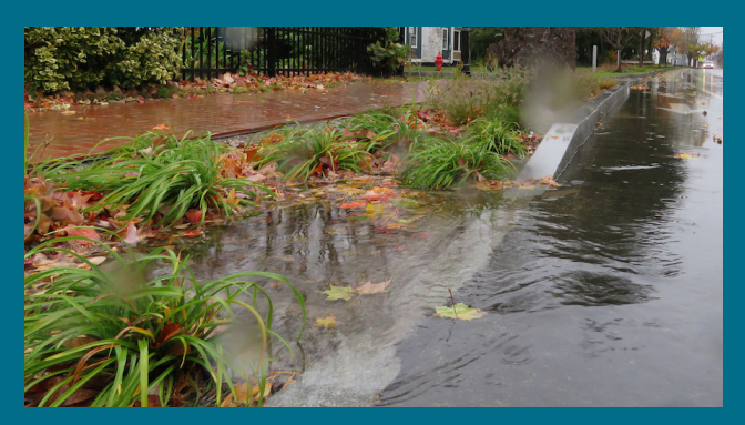
Above: Rain garden that was constructed as part of the Silver Street Improvement Project

The Silver Street Reconstruction Project was completed in 2016 and included a redesign of the road's right-of-way to reduce traffic speeds, improve pedestrian safety, and enhance water, sewer, and traffic management infrastructure. Among these comprehensive streetscape improvements, stormwater management and treatment was also a top priority. A large bioretention rain garden with an outdoor classroom was installed at the Woodman Park School and other improvements were made within the street right-of-way.