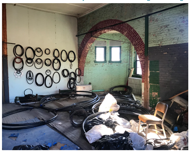
Above: The interior of the Old Water Works Building

Well, and the Isinglass Recharge Station, have been reconstructed to expand interior space and upgrade the buildings. In the wellhead building projects, creating separated and secure storage space for chemicals, improving energy efficiency, and bringing electrical systems up to code were priorities. Short-term health and safety upgrades were made to all facilities including correction of electrical code violations, repair or installation of chemical containment, and installation of chemical analyzers to monitor finished water quality.