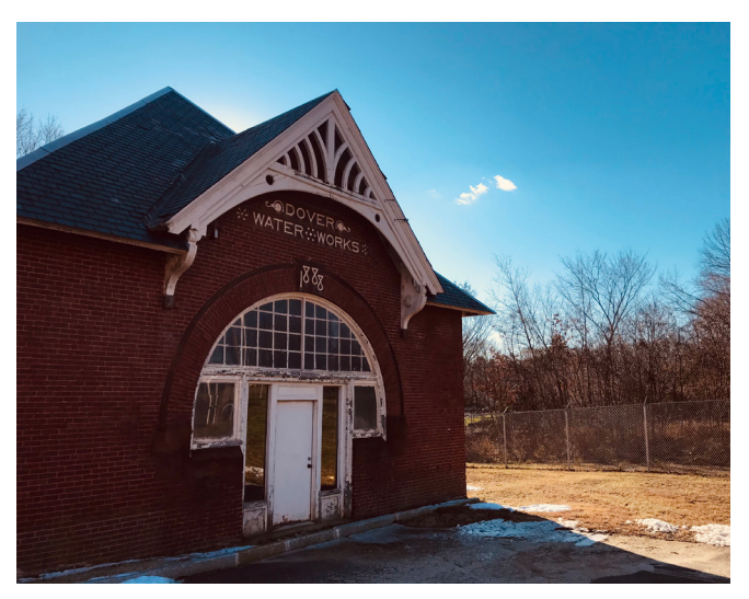
Above: Old Water Works Building

In 2015, Underwood Engineers updated the City's Water Facilities Plan and identified a multi-phase program for recommended improvements to the City's water facilities and infrastructure. All of Dover's wellhead buildings, aside from Hughes