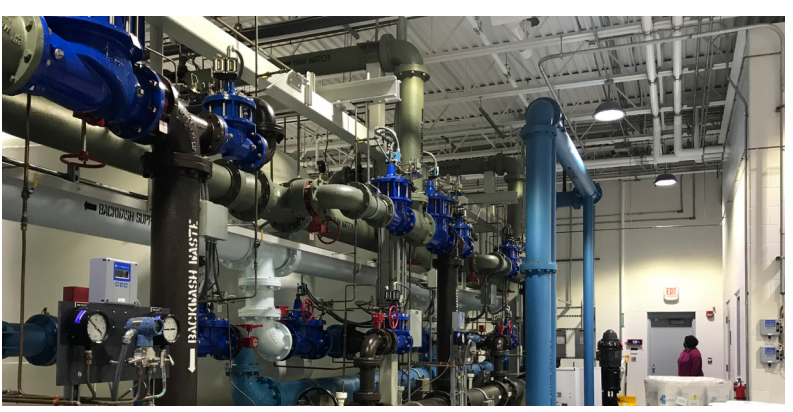
Above: The recently constructed Lowell Water Treatment Plant