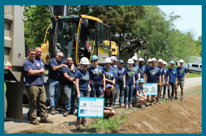
Above: Volunteers help create a rain garden at

Rain gardens are small, landscaped depressions that are filled with a mix of native soil and compost, and are planted with trees, shrubs and other garden-like vegetation. They are designed to temporarily store stormwater runoff and reduce runoff pollutant loads. In 2020, the City of Dover Community Services Department partnered with the New England Water Environment Association to complete a rain garden service project along the right-of-way of Hellman Avenue. In this project, the City utilized a filtering catch basin to collect and direct polluted stormwater to a rain garden. This project demonstrated the power of partnership and incorporated collaboration, education, and outreach with the Youth Education Committee.