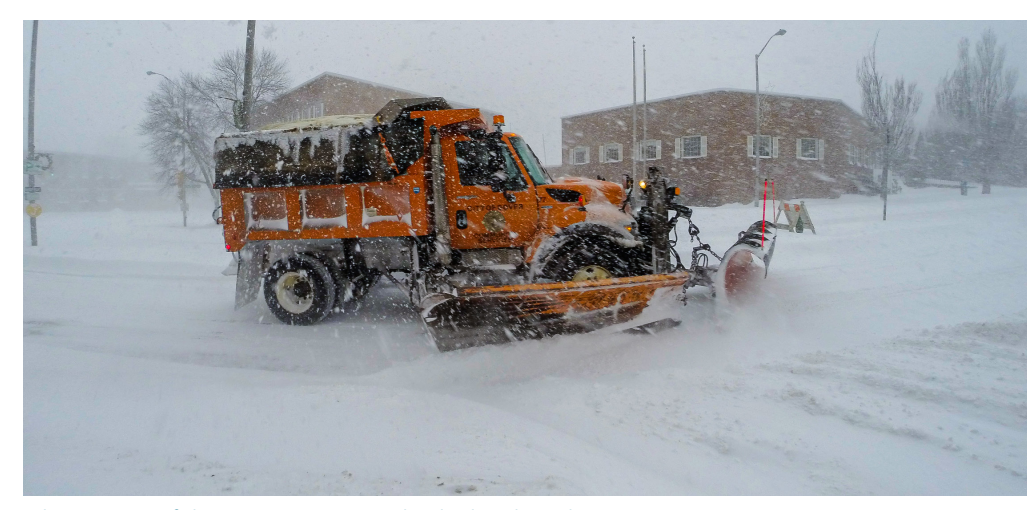
Above One of the many city-owned vehicles that Fleet Services maintains.