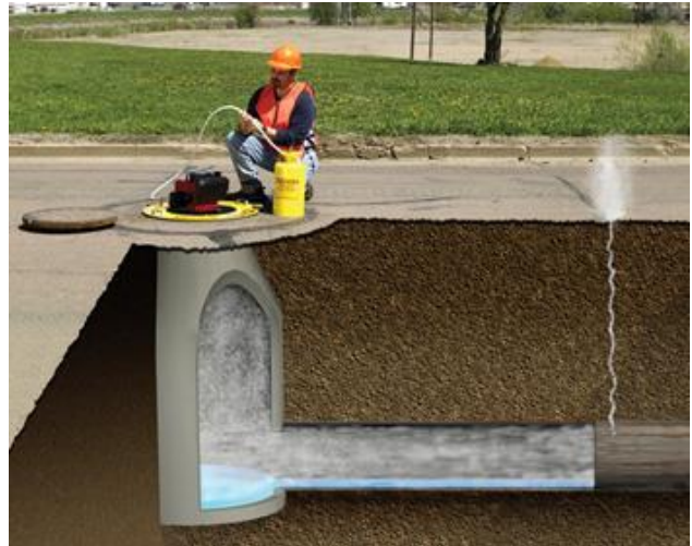
1: Smoke Testing (photo for informational purposes only)