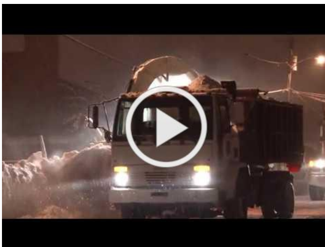
How to sign up for City of Dover Parking Ban text alerts

This video explains in detail how to sign up: