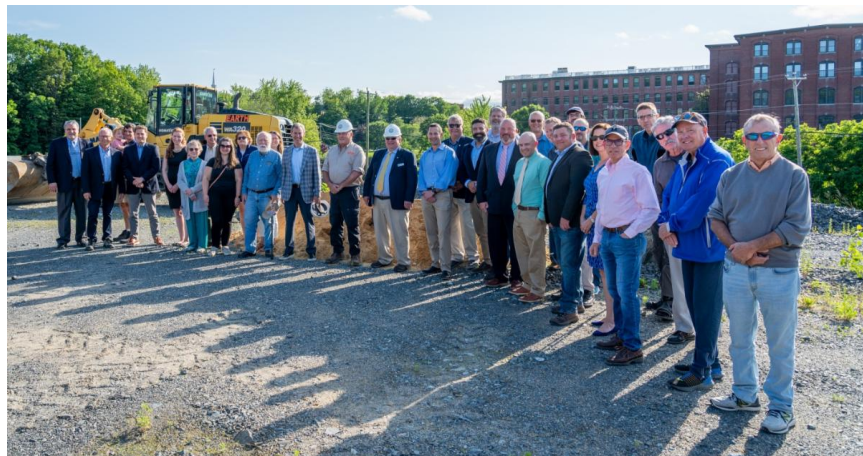
Dozens of current and former officials attended this week's

For more information about the waterfront development project, visit https://www.dover.nh.gov/government/city-operations/planning/cochecho-waterfront-development/