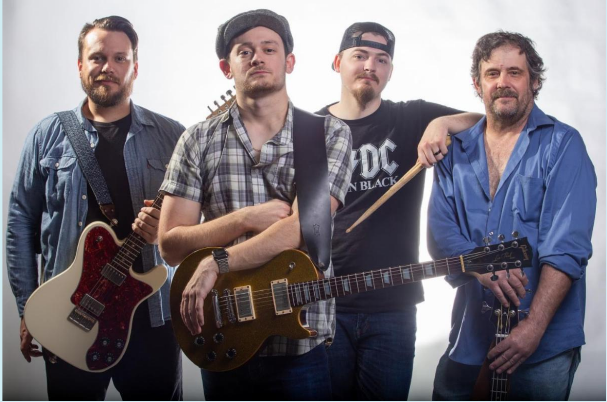
Dancing madly Backwards