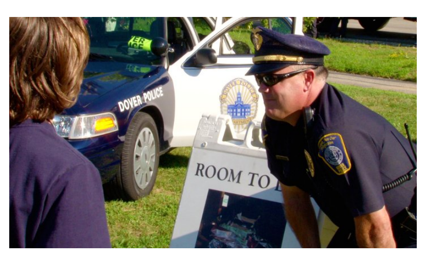
Dover Night Out is Aug. 6

For more information, visit <a href="https://www.facebook.com/groups/1473302736080740/">https://www.facebook.com/groups/1473302736080740/</a>.