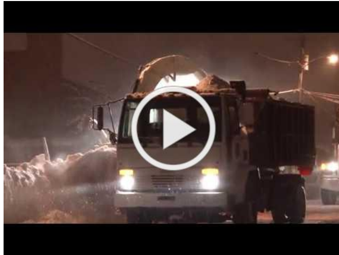
How to sign up for City of Dover Parking Ban text alerts

This video explains in detail how to sign up: