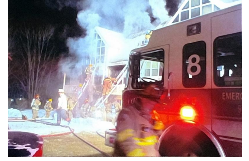
Dover Fire and Rescue crews respond to a fire at Edgar Bois Terrace last December.