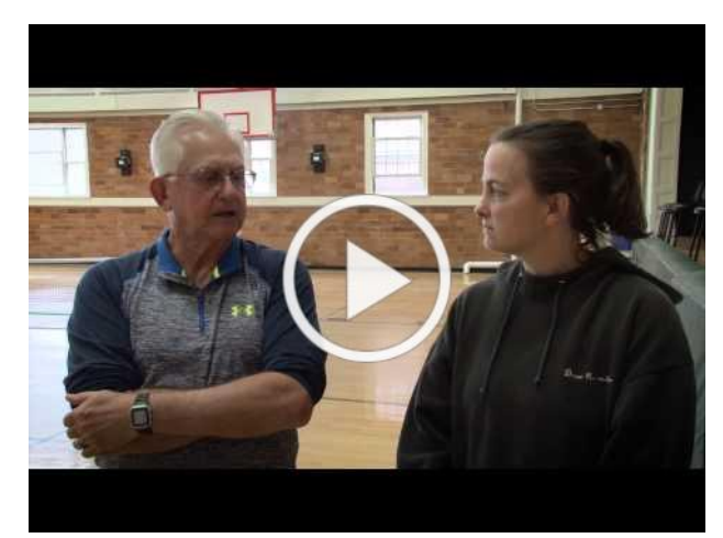
Pickleball at Dover Recreation

For more information, please call 516-6436 or visit the <u>Pickleball page here</u>.