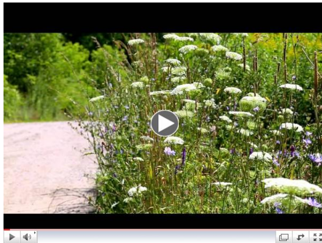
Tour the Bellamy River Wildlife Management Area

The rain date will be Wednesday, Aug. 20.