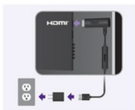
Roku Streaming Stick 4K