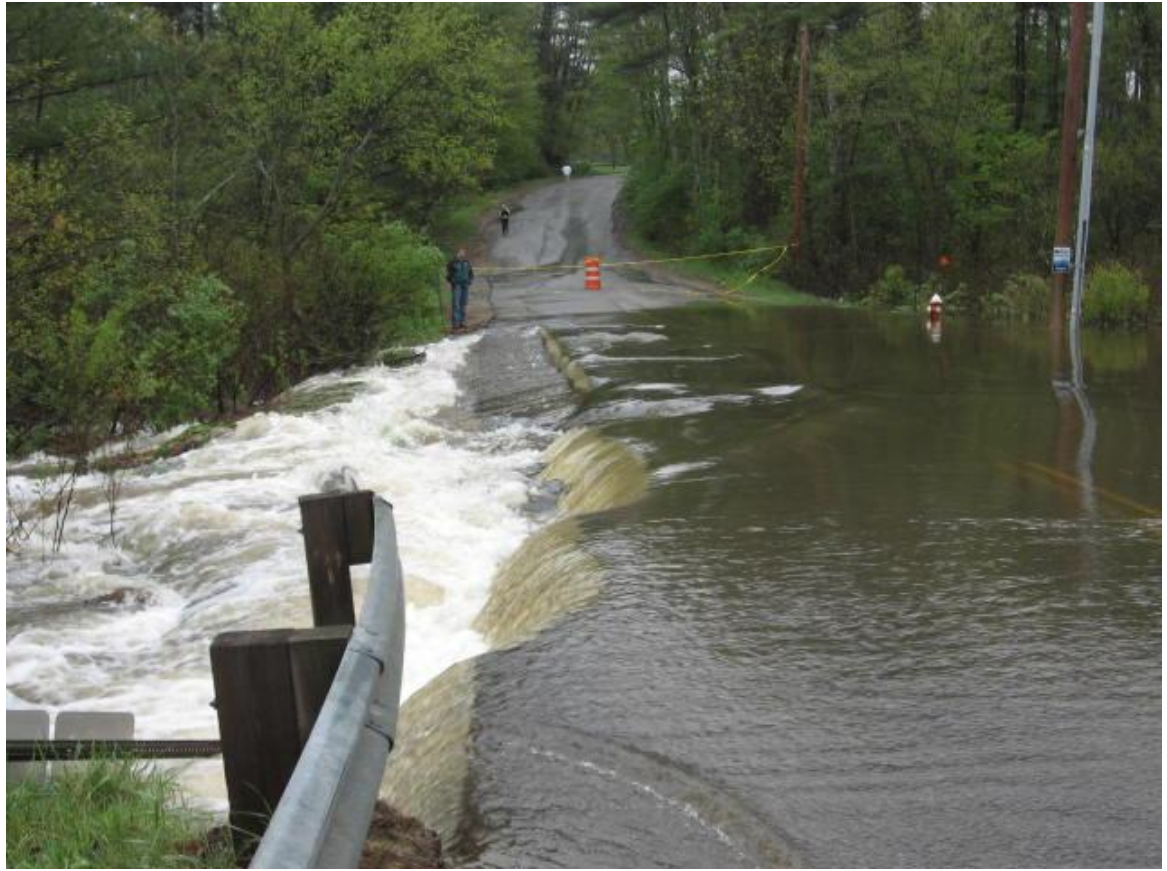
Flooding in the City of Dover; 2007

Table 3.2 provides more information on past and potential hazards in Dover.