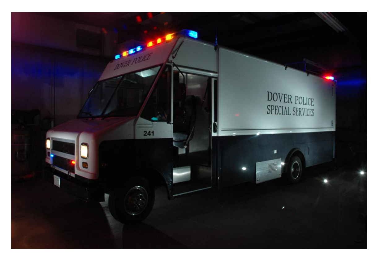
Dover Police Command Vehicle

Terrorism is a fear throughout our country and our world, and Dover is no different. There are six major transportation routes that pass through Dover (NH Routes 4, 9, 16, 108, 125, & 155) and the City's Downtown Business District is heavy with small businesses and the City has a relatively large commercial industry. A likely "target" that was discussed for a terrorist attack may be the Water Treatment Plant, as the effect on residents would be severe. However remote the possibility, terrorism is identified as a possible hazard for the City.