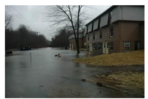
Old Madbury Lane Apartments

The property at 63 Snows Court is located next to the Cocheco River and when the area does experience severe storm events that building, which is a split level single family home as shown in the Google Maps/street level photo, does get four feet of water or more in the basement which was finished.