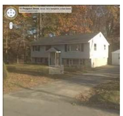
63 Snows Court

Dover has been a participant in the National Flood Insurance Program since April 15, 1980. There are 48 policyholders in the City. Seventeen claims were made since participation began with $86,391 in insured losses. There are two repetitive loss properties insured under the NFIP. They are located on (1) Knox Marsh Lane – Old Madbury Lane Apartments and (2) at the Intersection of Prospect Street & Snows Court – Single Family House. There are 214 parcels with structures in the Dover floodplain, with a total value of $30,016,754.