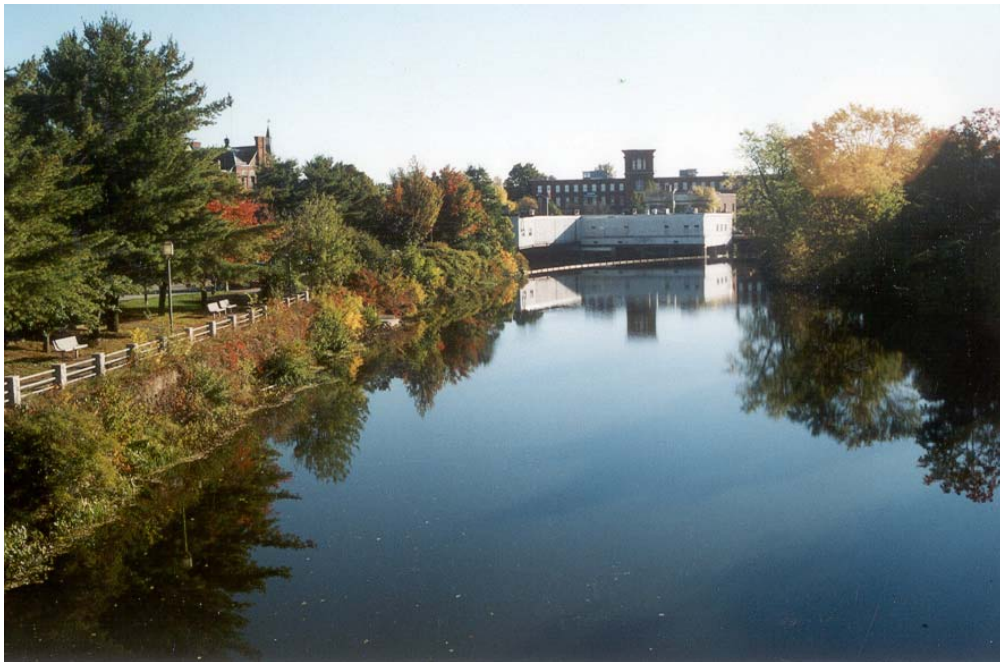
Cochecho River – Looking east from Chestnut Street Bridge