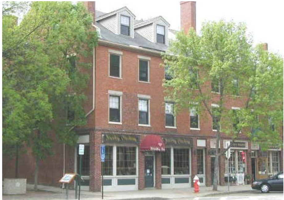
Jewelry Creations Building – Downtown Dover