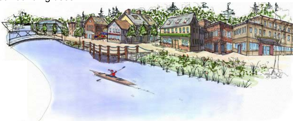
Example of buildings oriented toward river and pedestrian plaza along the river