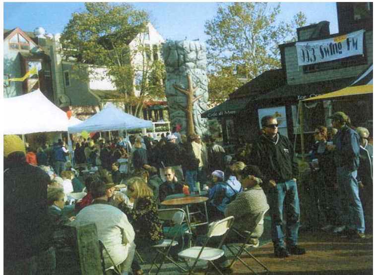
Newport, RI – Example of public gathering place for festivals and other community events