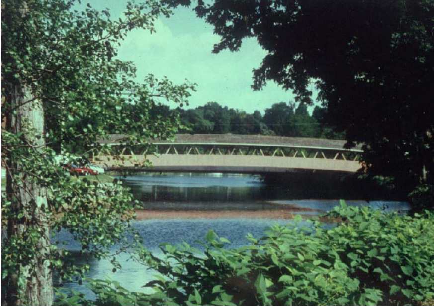
Existing Pedestrian Bridge Connecting Downtown to Riverfront – Future site of vehicular bridge