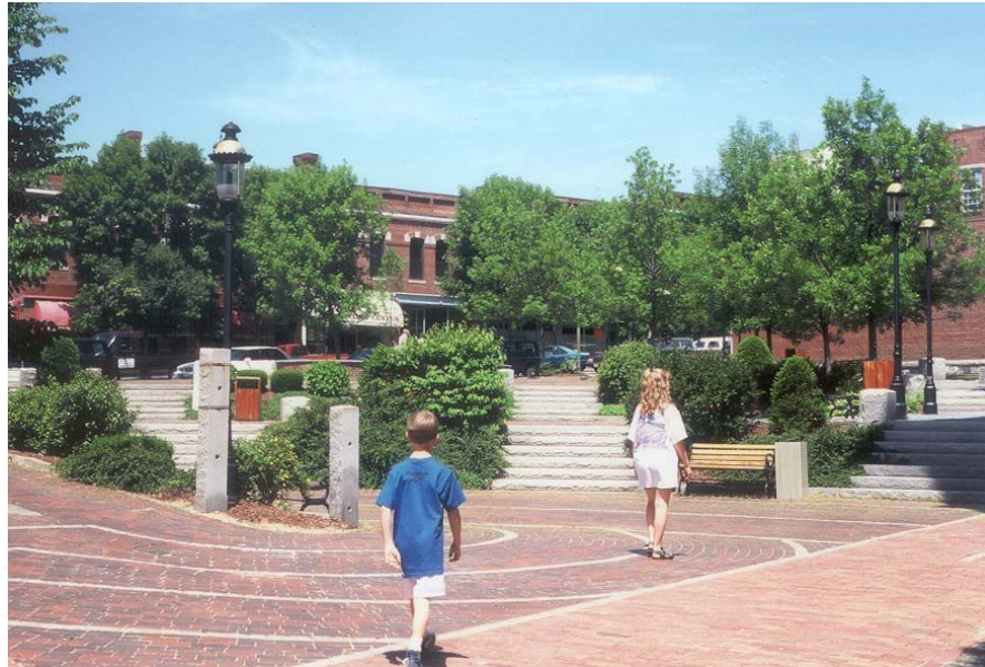
Downtown Dover – Cochecho Mill Courtyard