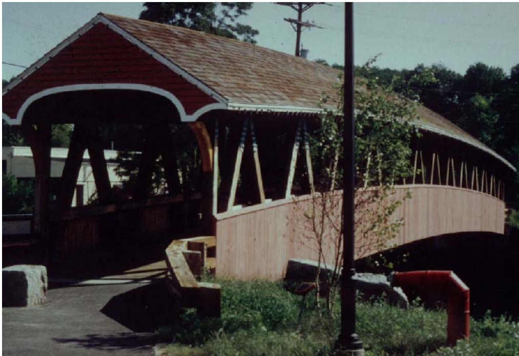
Cochecho River Pedestrian Bridge Linking Waterfront Area and Downtown Dover