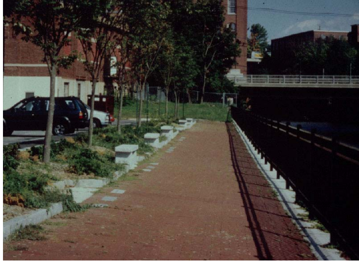
Existing Riverwalk in Henry Law Park – Dover, NH