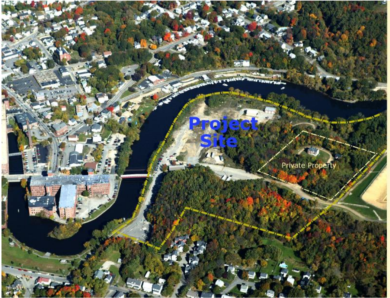
FIGURE 1 – AREA OF INTEREST