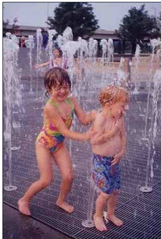
Activities to attract families down to the waterfront