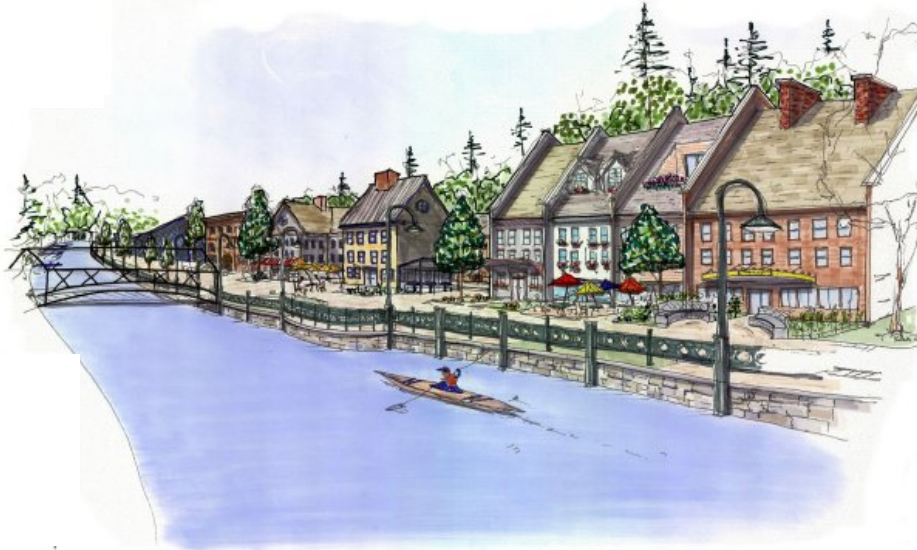
Example of buildings oriented toward river and pedestrian plaza along the river