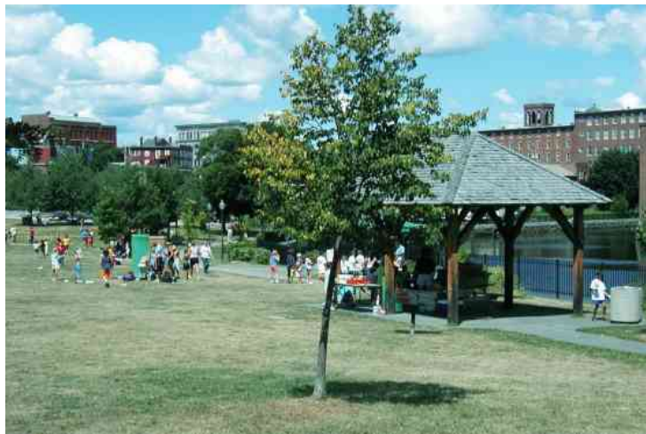
Henry Law Park, Dover, NH

Framingham, MA, Landscaping Requirements of Highway Overlay District section of Site Review Regulations