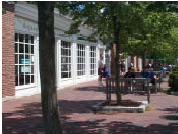
Lexington, MA – Example of intermingling of landscaping, building and walkways