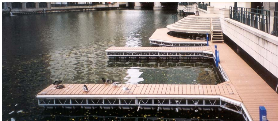
Public docking facilities and public access to the river