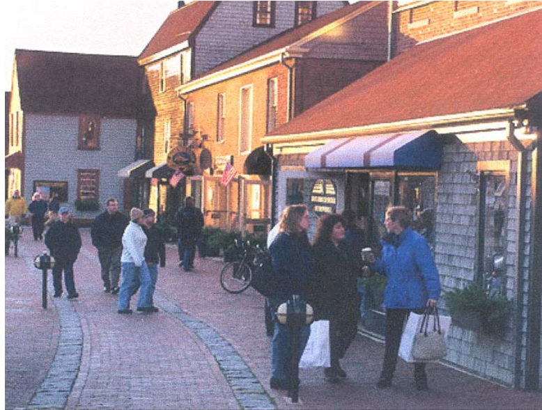
Newport, R.I. – Example of mixed building types, materials and colors