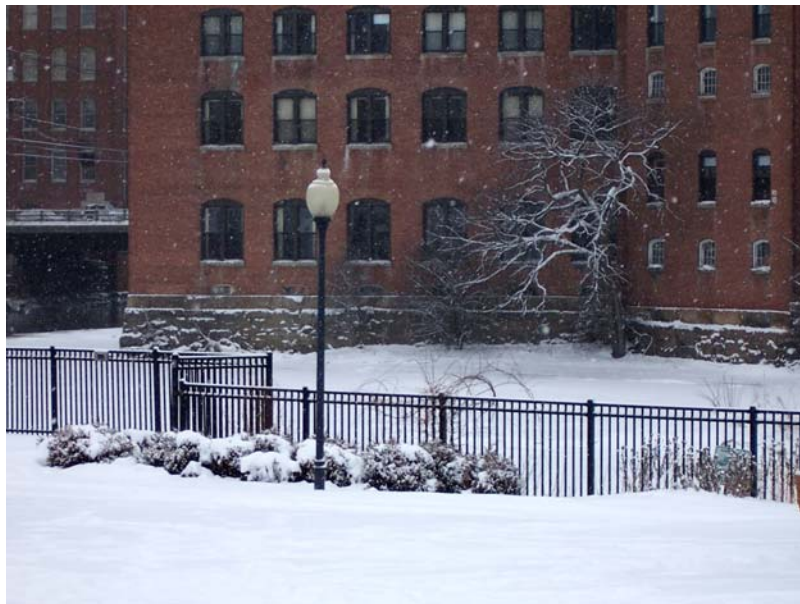
Existing lighting and fencing at Henry Law Park