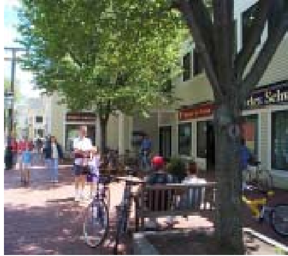
Lexington, MA – Inviting Public Spaces – Source: Non-Residential Development: Community Character Guidelines , Nashua Regional Planning Commission