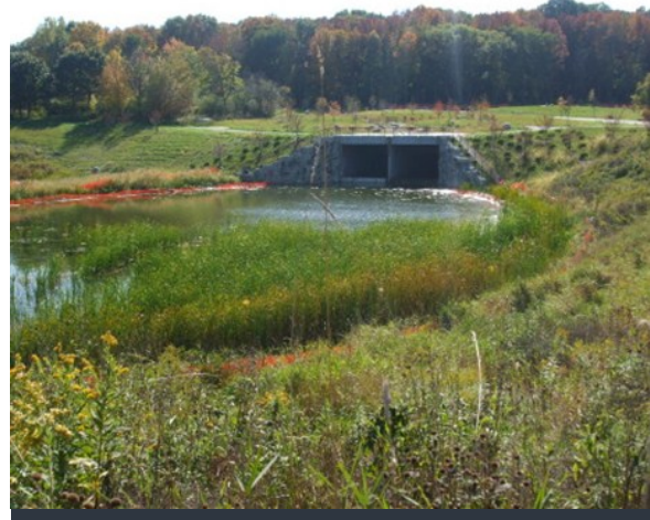
Milwaukee Metropolitan Sewerage District (MMSD) partnered with The Conservation Fund to protect key properties around Milwaukee where major suburban growth is expected. As of 2013, the program, known as Greenseams, had protected over 2,700 acres of land capable of storing an estimated 1.3 billion gallons of water. By protecting this land, MMSD reduced future flows into receiving rivers and mitigated future flooding.

Tucson, Arizona passed a commercial rainwater harvesting ordinance requiring facilities to meet 50% of landscape irrigation demands using harvested rainwater. Covered facilities are required to prepare a rainwater harvesting plan and water budget, meter out-door water use, and use irrigation controls that respond to current soil moisture conditions. Green streets also infiltrate rainwater to augment local water supplies and filter runoff to reduce water pollution.