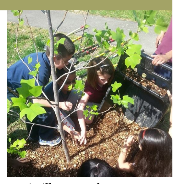
Louisville, Kentucky recently began a canopy assessment to determine how the city can use trees to address urban heat, stormwater management and other concerns. "Knowing where we lack canopy, down to the street and address level, will help our efforts exponentially." says Mayor Greg Fischer.

How does it work? Through shading, windbreak, and evapotranspiration, trees, green roofs and vegetative cover can lower ambient air temperatures in urban areas, lessening the need to turn up the AC in summer months.