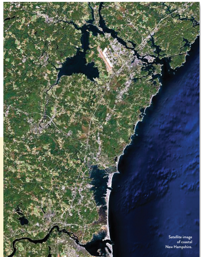
Satellite image of coastal New Hampshire.