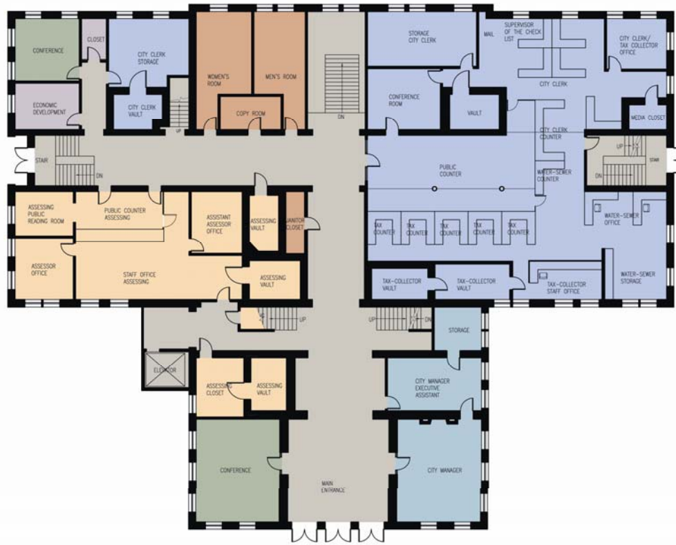
① Option B: First Floor Plan 1/8" = 1'-0"