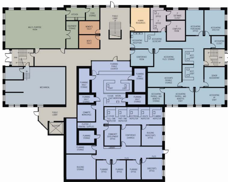
① Option B: Lower Level Floor Plan 1/11/11 3/22-11-0