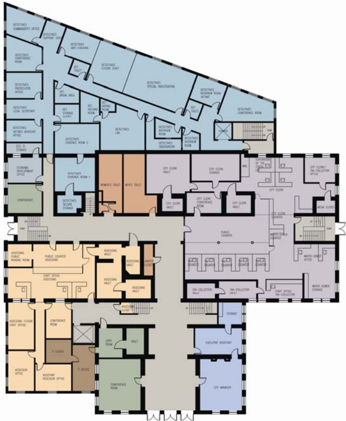
Option A: First Floor Plan 1/1/1 1/1/1