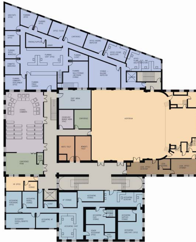
Option A: Second Floor Plan 11.1.1-1 1/2011-12