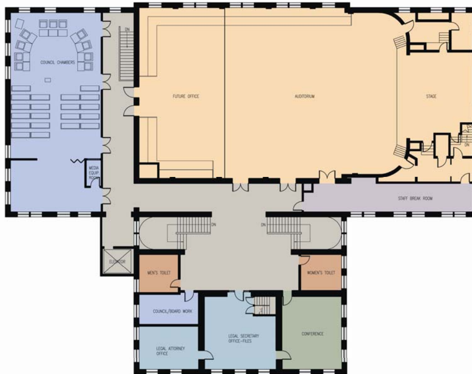
① Option B: Second Floor Plan 1/8" = 1'-0"