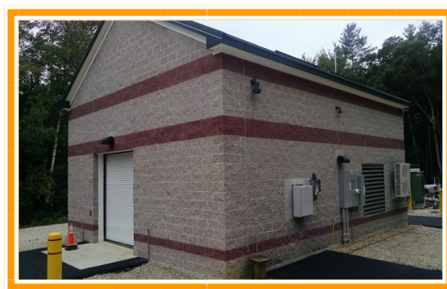
Calderwood Treatment Building

City of Dover Community Services Department