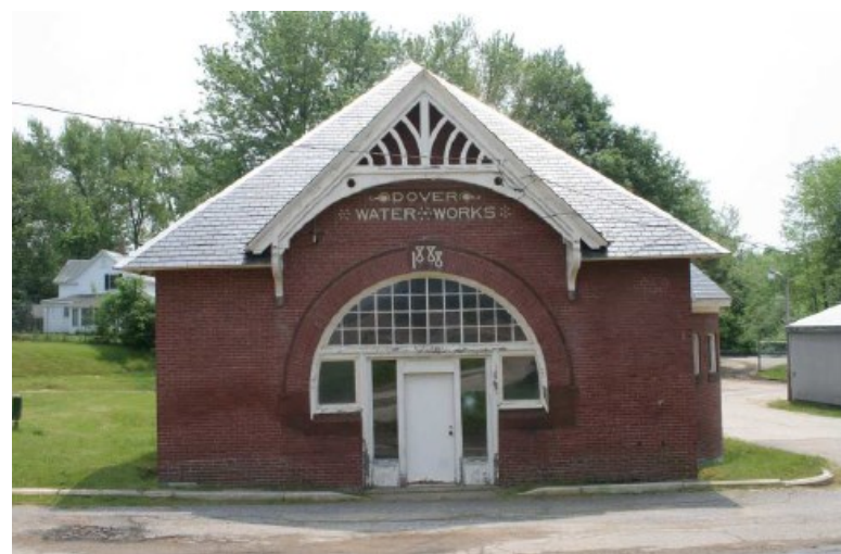
Dover Water Works Site est. 1888

pCi/L: Picocuries per liter is a measurement of radioactivity in water. A picocurie is 10–12 curies and is the quantity of radioactive material producing 2.22 nuclear transformations per minute.