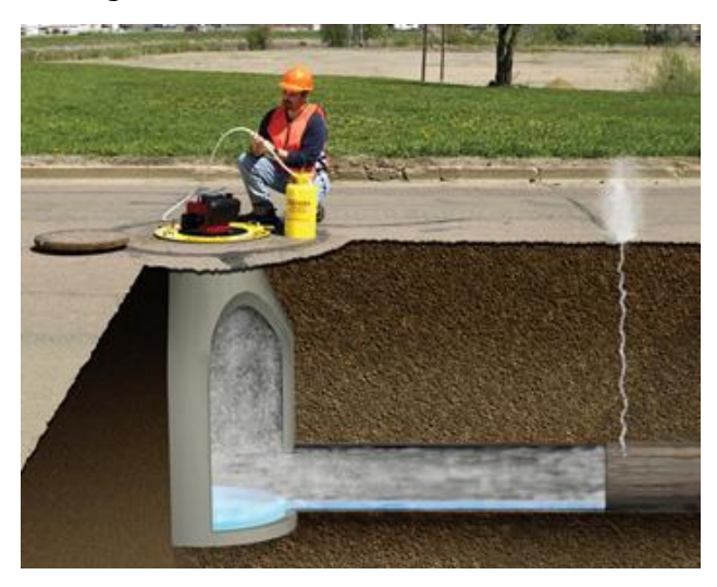
1: Smoke Testing (photo for informational purposes only)

departments of where they will be conducting smoke testing each day.