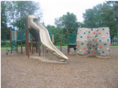
Home Street School Playground