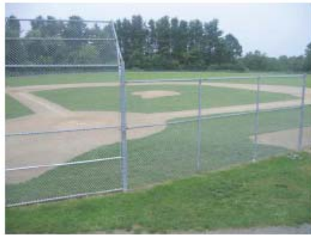
Woodman Park Baseball Field