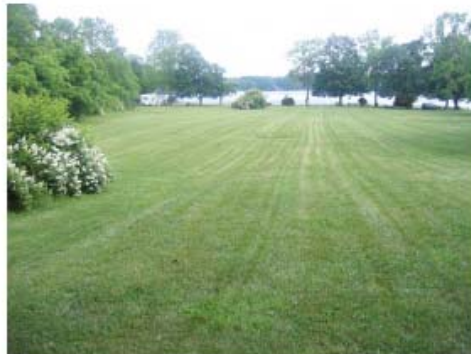
Hilton State Park