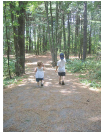
Willand Pond Trail