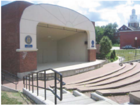
Rotary Arts Pavilion