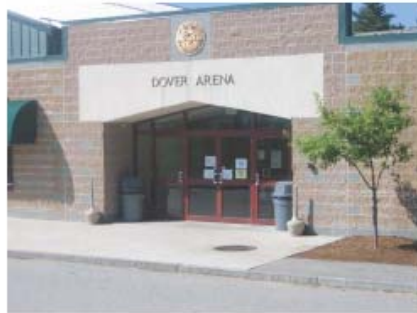
Dover Ice Arena