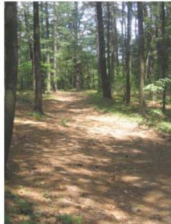
Willand Pond Hiking Trail