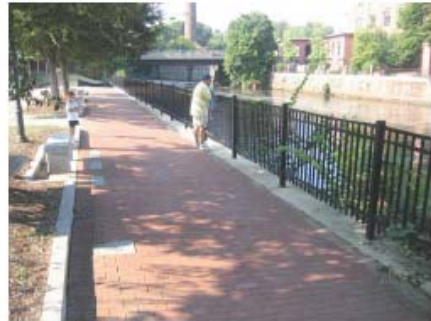
Cochecho River Walk