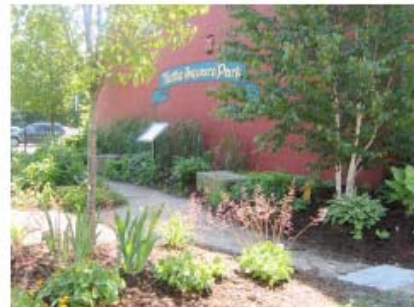
Tuttle Square Park