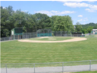
Dover Little League Baseball Fields