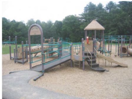
Garrison Elementary School Playground