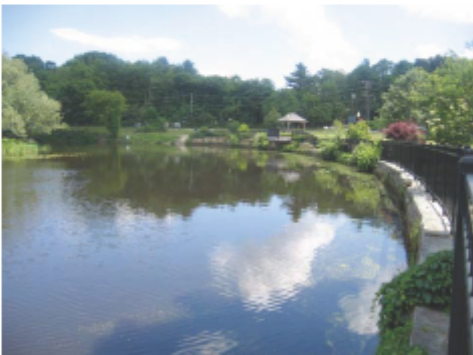
Henry Law Park and Cochecho River