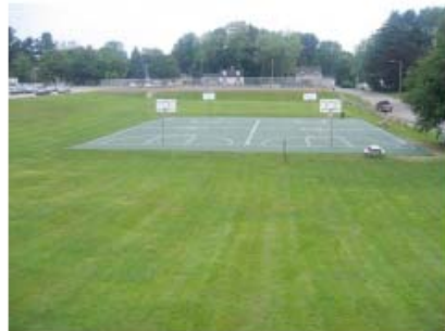
Woodman Park Basketball Courts