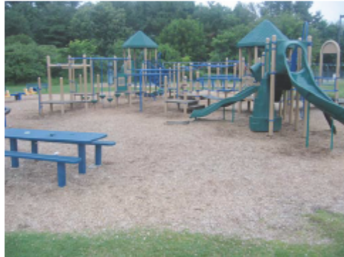
Woodman Park Playground