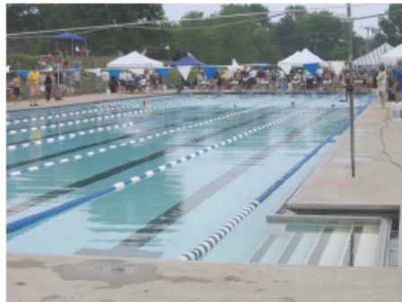
Jenny Thompson Outdoor Pool