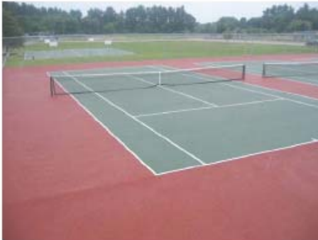
Woodman Park Tennis Courts