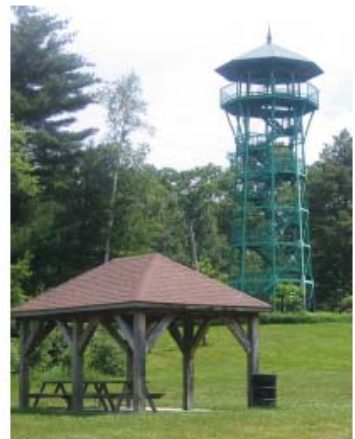
Garrison Hill Park