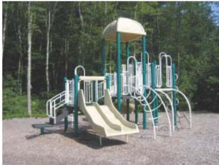
Alden Woods Playground