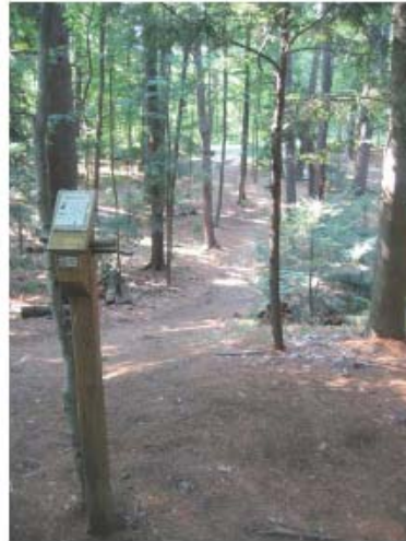
Bellamy Park Disc Golf Course