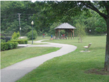
Henry Law Park