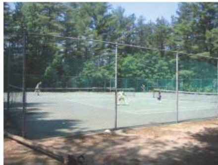
Long Hill Park Tennis Courts