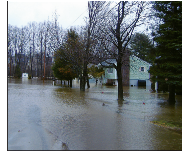
Dover Flooding 2008